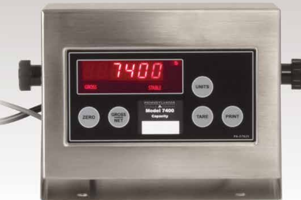
5-button front panel includes tare and gross/net buttons