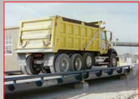
Accommodates up to 10 load cells for a wide range of weighing applications