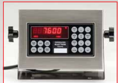
Full numeric keyboard model (7600E) available with expanded features and data entry