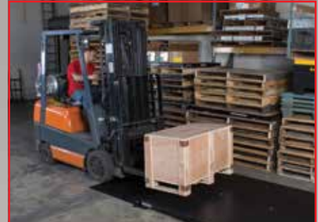
Custom applications available at standard pricing